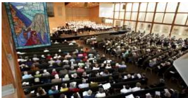
2012 Presbyterian Choir Festival

St. Andrew's Presbyterian Church, 7650 N. Paseo Del Norte