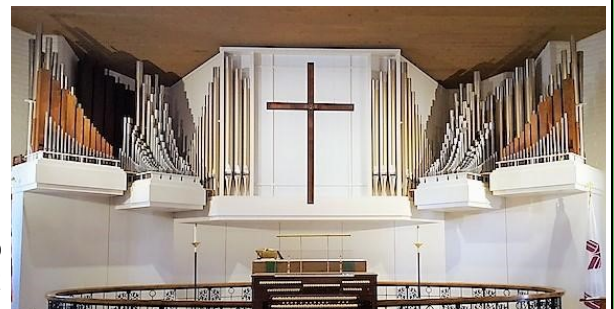
Holtkamp, Opus 2112 (2015) Lutheran Church of the Risen Savior

Meet at the East parking lot of Catalina United Methodist Church (2700 E. Speedway) at 9:15 a.m. The drive to Green Valley should take approximately 40 minutes. Stop lists and other information about the churches will be available during the tour.