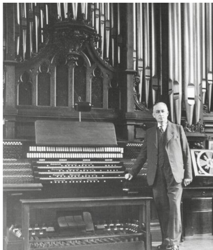
Marcel Dupré at his organ