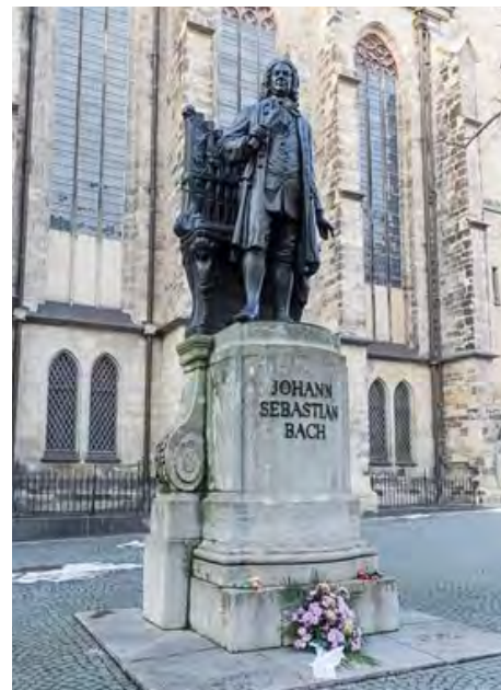
Bach statue at the Thomaskirche

Happy Birthday to Bach, Chopin, Vivaldi, Haydn, Ravel, Bartók, Rimsky-Korsakov, Mussorgsky, CPE Bach, Smetana, Telemann, Barber, Wolf, Reger, Strauss, Villa-Lobos, Gesualdo, Honneger, Reubke