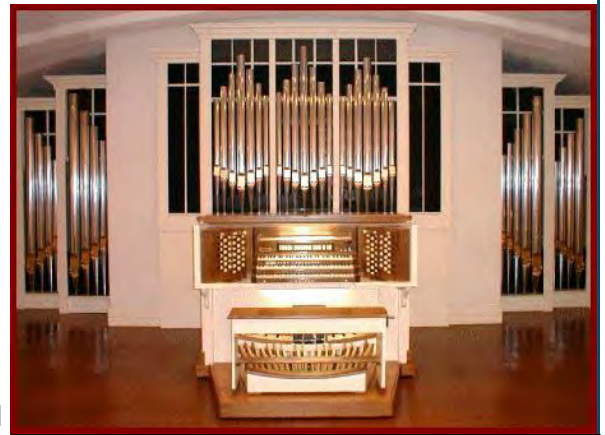
Quimby organ (Opus 51, III/46), 1999